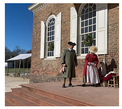
Colonial Williamsburg Court House with people in period costume.

MidAtlantic breakfast retiree group meets monthly the first Tuesday, at the Bob Evans in Woodbridge, VA.