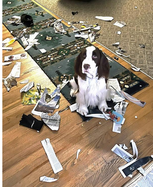
A consequence of a retiree who failed to take the advice of getting a mature dog rather than a puppy. What is left of the January issue of the National Geographic.

The winter quarter retiree lunch will be held on January 17th at the Elmers on NE181st Street. Watch your email for details.