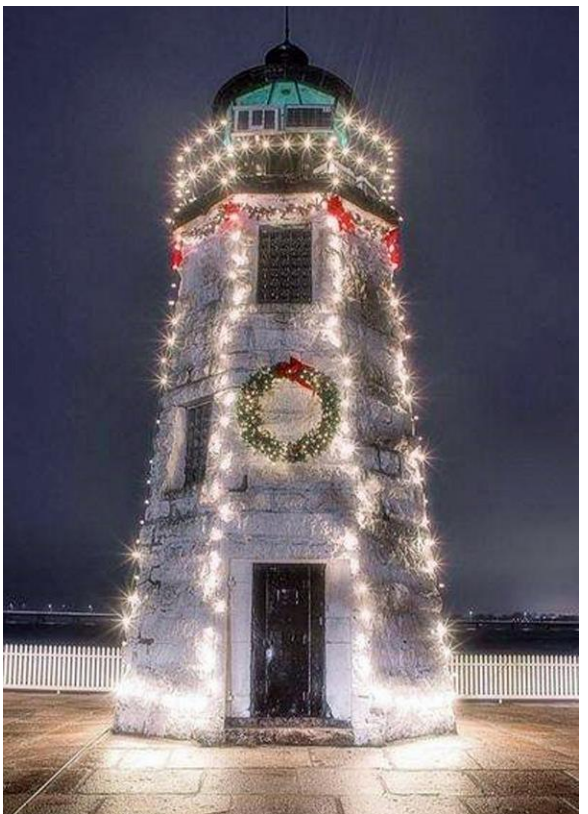
Newport, Rhode Island lighthouse