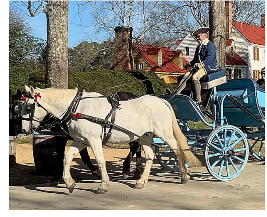
A Colonial Williamsburg tourist carriage